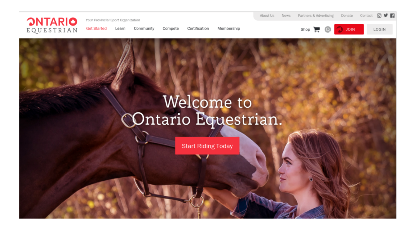
STEP 2: Login using the same email address used for your 2023 Membership, or create an account for new Members

If you create a new account, you will be assigned a new OE and OHJA number. If you are a new member select "Join".